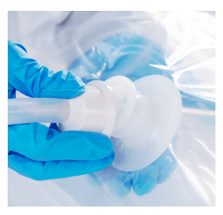
DPTE® BETA BAG WITH HOSE BARB PORTS

Elevate your confidence in the integrity of your sterilizing filters by implementing one of our configurable pre-use post sterilization integrity testing (PUPSIT) designs with a filter of your choice. Our agnostic component library allows for freedom of design and ensures a perfect fit for your specific process.