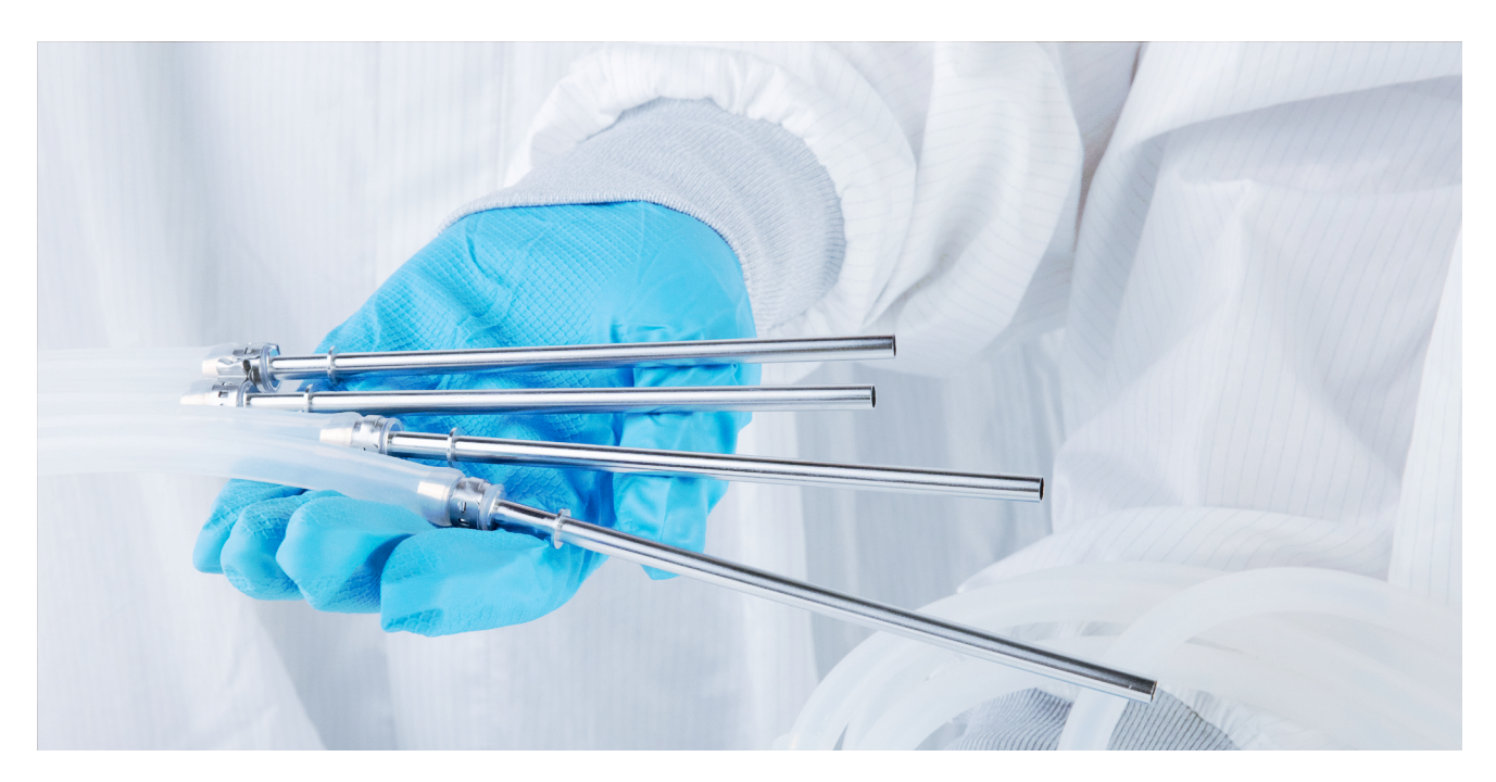
ACCURATE DOSING NEEDLES FIT TO YOUR BRAND FILLER