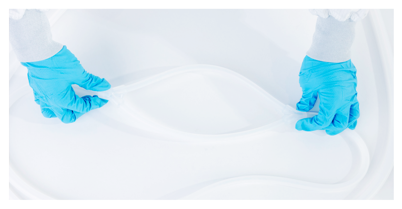
OVERMOLDED DOSING PUMP LOOP, MICRO BORE SIZES AS SMALL AS 0.032 IN. (0.76MM) ID, COMPATIBLE WITH MULTIPLE PUMP TUBING BRANDS AND DUROMETERS