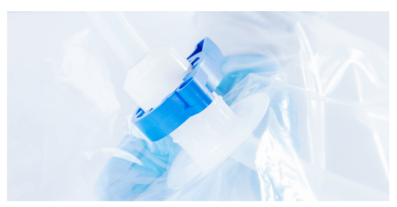
OVERMOLDED THRU TC ON BETA BAG