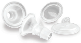
TC FITTINGS, END CAPS, ELBOWS, REDUCERS

When a single drop of fluid can make the difference in someone's health, you need smart fluid handling solutions that get the job done safely. We've invested in the manufacturing of polymeric components so you can improve yield, cut costs and improve time to market.