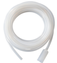
SILICONE OVERMOLDING (VARIOUS GEOMETRIES)