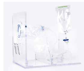
CUSTOM PORTED BETA BAGS