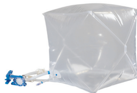
2D/3D STORAGE AND MIXING BAGS